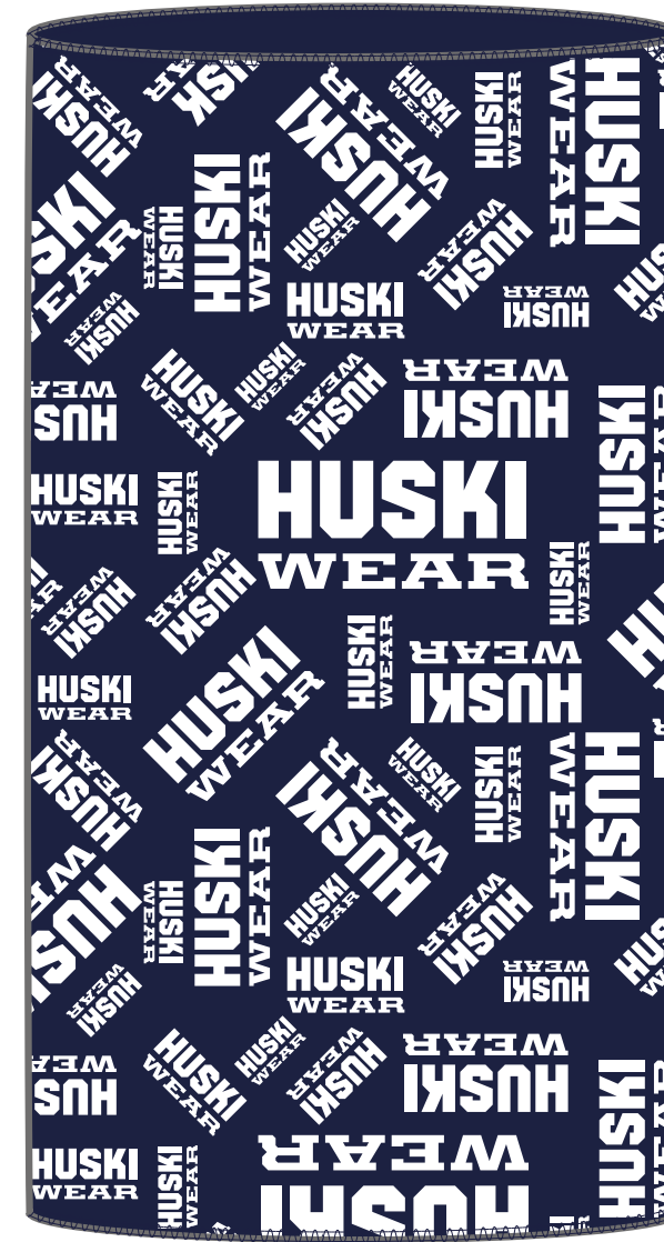
NAVY BLUE (WHITE ARTWORK PRINT)