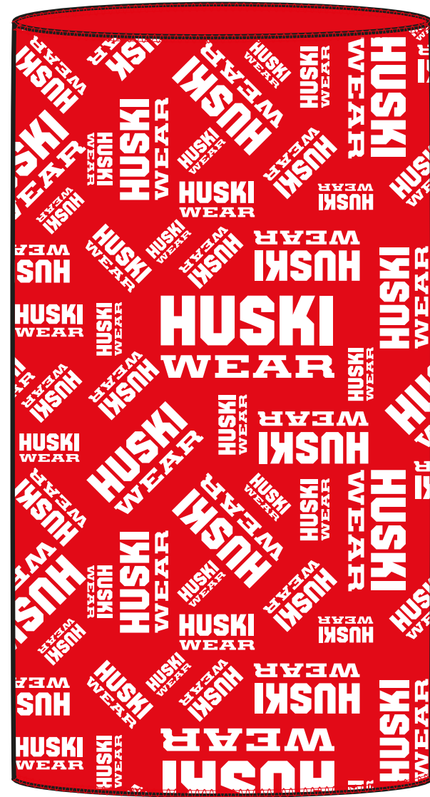
HUSKI RED (WHITE ARTWORK PRINT)